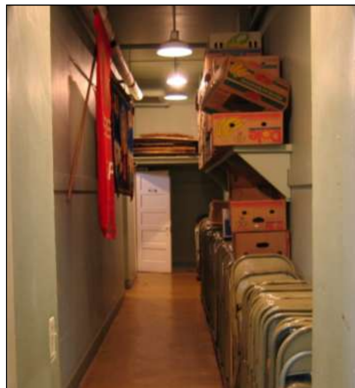
The tight entrance to the hallway will be expanded to accommodate the handicapped.

The Food Program, which includes both the Friday Food Bank and the Sunday Dinner Program, is Blessed Sacrament's primary social services ministry. Managed solely by volunteers, the Sunday Dinner Program served 23,000 meals in 2007, and has served every week since 1970 - an amazing track record of service. An informal survey of our guests revealed we are reaching portions of the homeless population deemed underserved by the United Way of King County: at least 55% of our guests are of minority ethnic background.