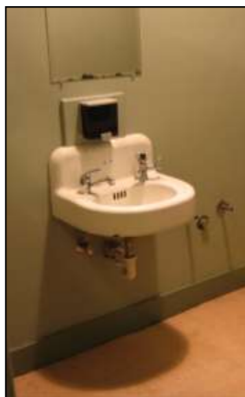
Our current restrooms have only one sink for hundreds of guests.

The restrooms will be completely redesigned to become handicapped accessible and to accommodate greater numbers. Storage space will be created from the empty space underneath the church, requiring the removal of tons of dirt. These and many other features of the Renovation will dramatically improve the way in which we serve the most needy of our community and better treat our volunteers and parishioners.